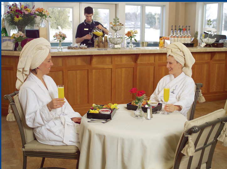
Spa Poolside Café

Comforting textures, fragrant scents, soothing sounds, sights to behold... your spa experience wouldn't be complete without an equally delightful adventure for your sense of taste. The Spa at Stoweflake's Cuisine, prepared by our award-winning Executive Chef, combines a purity of ingredients with an explosion of flavor to create a meal sure to gratify both your body and your soul.