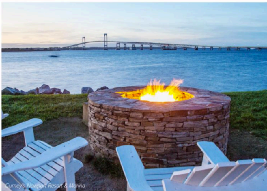
Gurney's Newport Resort & Marina